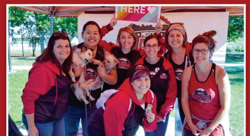
Top Photo by Bob Cox